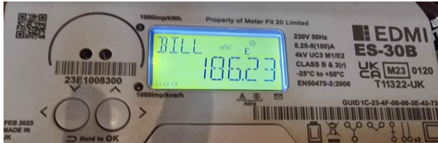
Cost of Energy Used 16 th August – 7 th November 2023.

Travel 131 miles @ 45 pence per mile = £58.95