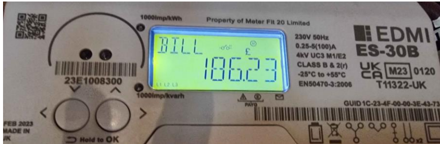
Cost of Energy Used 16 th August – 7 th November 2023.